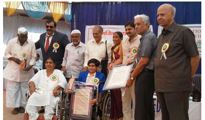
The awardees and the guests at the World Disability Day

In Kolhapur, World Disability Day was observed by the Helpers of the Handicapped and the ground breaking ceremony was held for AVANI's hostel for the girls rescued from being child labourers.