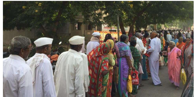
Patients waiting in que to be registered at the eye camp

In Dhule, at the alumni get together of the Institute of Printing Technology, the alumni expressed their gratitude to the institute for providing the education which would have been impossible if they had to go to big cities like Pune or Mumbai for the same. The other mega event was the annual eye camp which organizes eye treatment for more than 2000 patients at no cost.