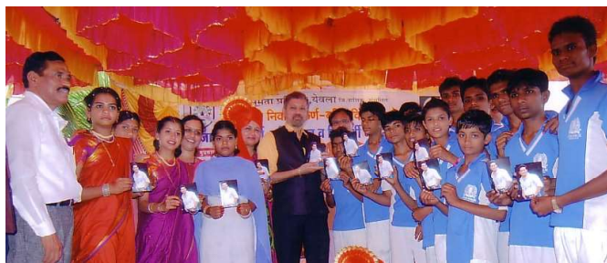
Students holding autographed photo of Sachin Tendulkar