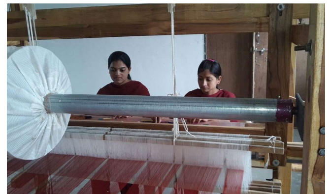
Trainees busy at the paithani weaving loom

With financial assistance from MSSO, Caring Friends in Mumbai and Arpan Foundation, Pratishthan constructed a vocational training centre for hearing impaired adults and from August 1, 2016, started vocational training in four trades – weaving of paithani (special variety of sari), computer operations, tailoring and welding.