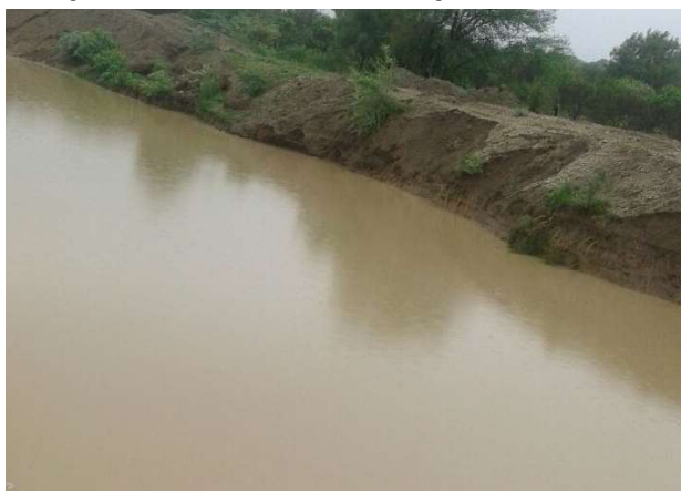
Rejuvenated dam after removing the silt