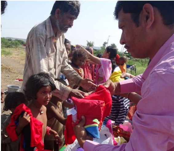
Clothes for deprived children during Diwali season

3,685 dropout females have been located. Parents of all of them were provided counseling, though only 30% of them agreed for the eyesight screening of their daughters.