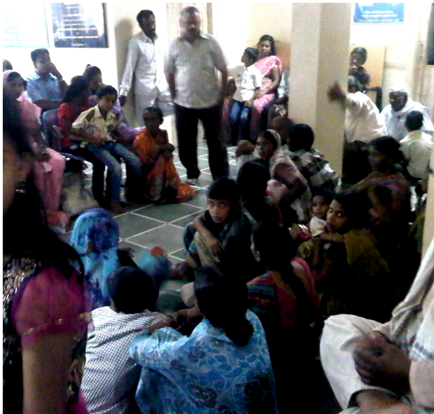
Pediatric patients and parents in an overcrowded waiting hall