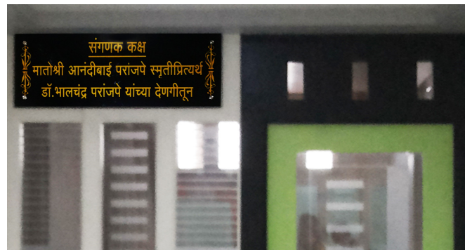
Entrance to Anandibai Paranjape Computer Laboratory