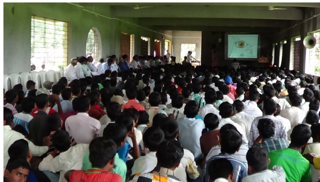
Eye-health education for school children

The outreach team running the project is going beyond the call of duty in reaching out to dropout students. The team was shocked to find that the students who dropped out after grade eight did not know how to read and write. The team not only screened them for vision deficiency but also taught them how to read and write. Additional progress details of the project may be found in the two interim reports posted on < mssoonline.org/downloads/interim-reports/vision-project-march-2013 >)