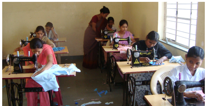
Sewing for livelihood of rescued girls

The victims originating from various parts of the country are provided free-of-cost food, clothing, shelter, medicines, counseling, legal aid etc. Snehalaya has initiated several unique pioneering measures to bring joy into the lives of under-privileged children, including curbing female feticide, rescue and rehabilitation of discarded new-born babies. With zero tolerance, Snehalaya has effectively curbed coerced prostitution of minor girls in Ahmednagar district. By supporting Snehalaya through financial assistance, MSSO hopes that Snehalaya can expand its potential and add more accomplishments to its impressive list of achievements.