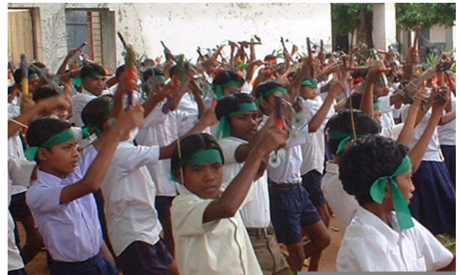
Children enjoy playing lezim

Started in 1989 Snehalaya ("Home of Love") serves the most neglected and exploited class of our society, primarily women and children who are Victims of Commercial Sexual Exploitation and Human Trafficking. They seek, rescue, support, empower, rehabilitate and re-integrate oppressed women, deprived children and distressed HIV/AIDS afflicted families through direct intervention. Snehalaya works in Ahmednagar District of Maharashtra and neighboring districts of Solapur and Nashik.